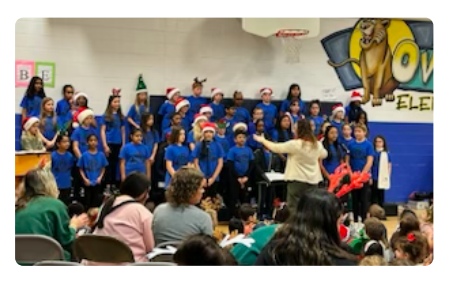
Jingle Bell Assembly